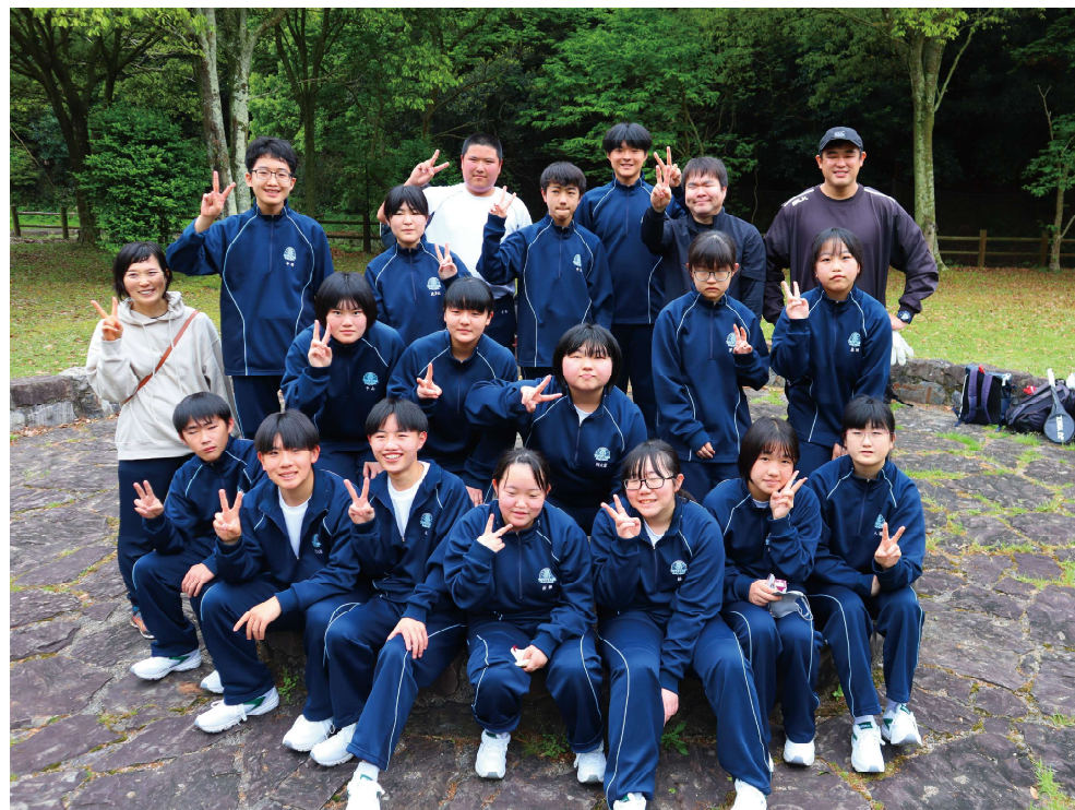
豊玉高等学校の生徒たち Nagasaki Prefectural TOYOTAMA High School Students

Nagasaki Prefectural Toyotama High School students spend their youthful days under the watchful eye of the sea god Watatsumi Shrine. The high school students, who have grown up thanks to the blessings of Tsushima's ocean, are now learning about the problems facing their hometown's ocean and learning from adults who are working to solve social issues related to the ocean. During their school trip to Osaka in December last year, they interacted with the Blue Ocean Initiative. Based on the advice they received there, they will share their ideas for protecting the beautiful and abundant ocean and their "hopes" for the future of the ocean from the unique perspective of the island's young people.