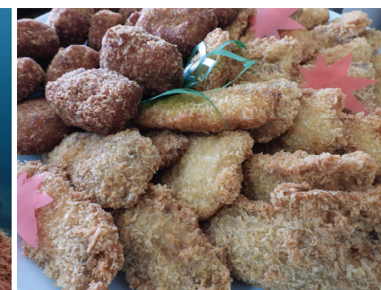
磯焼け食害魚の加工と付加価値化 Processing and adding value to fish that have turned the sea forest into desert.