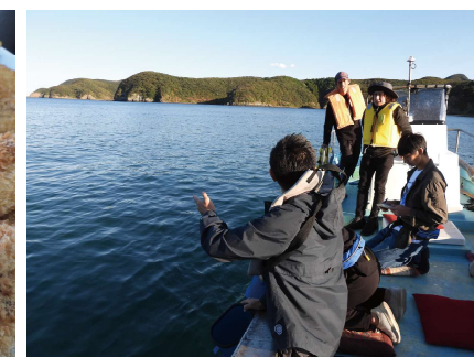
海と直接触れ合い、海を知ってもらう体験ツアー Experience tour where you can come into direct contact with the ocean and learn about it.

総合的な探究の時間において、対馬の先進的な水産事業者に海の現状や水産振興策を学ぶ In the course of inquiry-based learning, students learn about the current state of the ocean and measures to promote the fisheries industry from Tsushima's leading fisheries businesses.